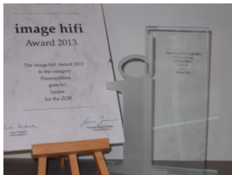
Germany Image Hi-Fi magazine Award 2013 Preamplifier categories as best product