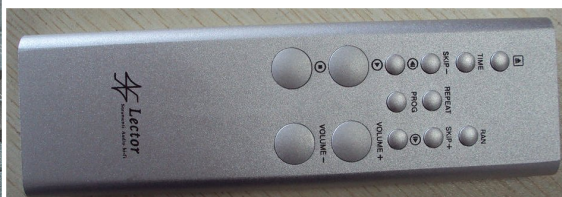
alluminium body remote control handset